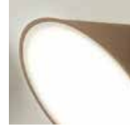
greige limited edition